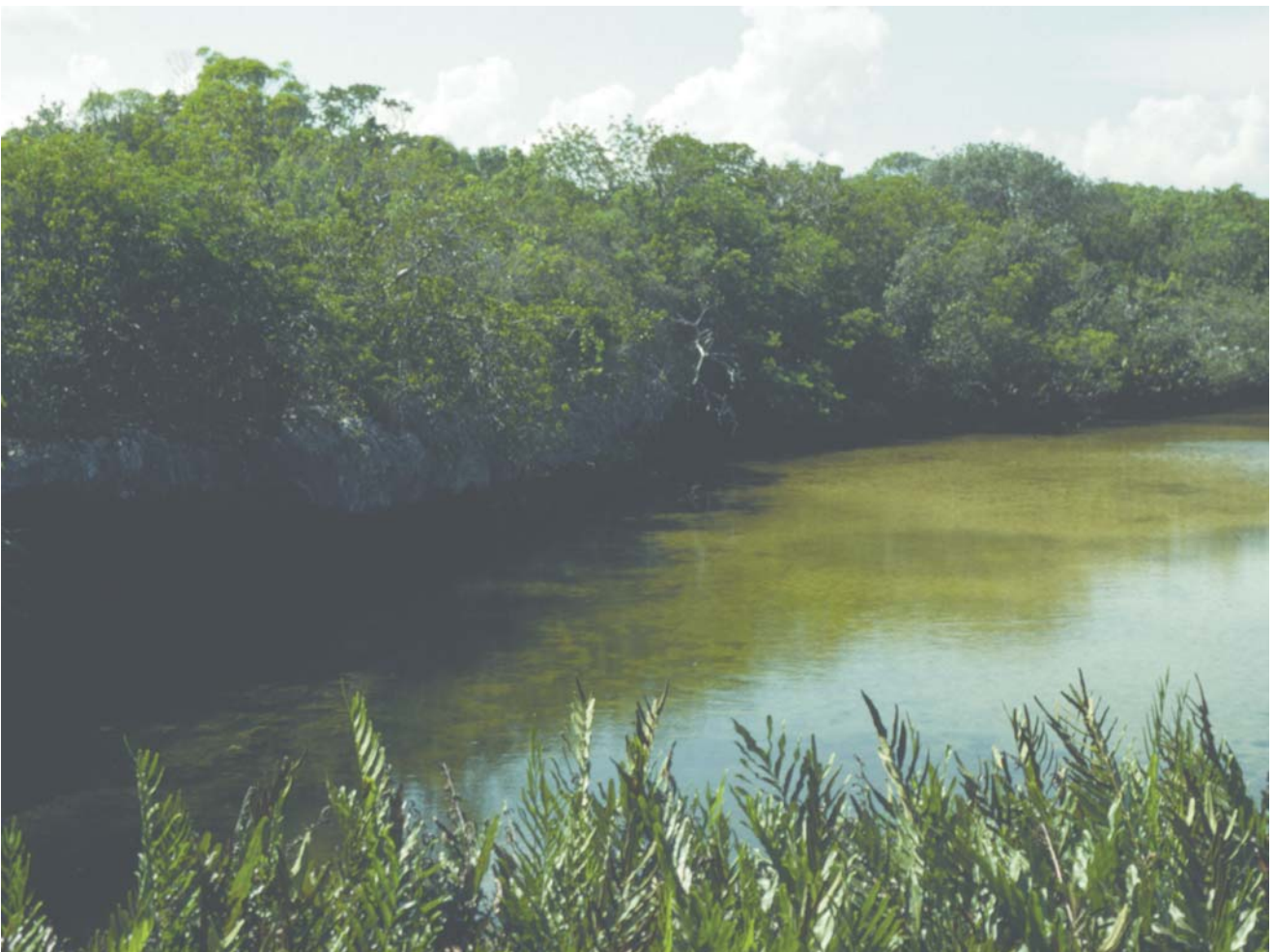
Figure 5. Donkey Hole. A fracture-line hole with water a metre or so deep. Tall Acrostichum ferns have colonised the water edge in the foreground.