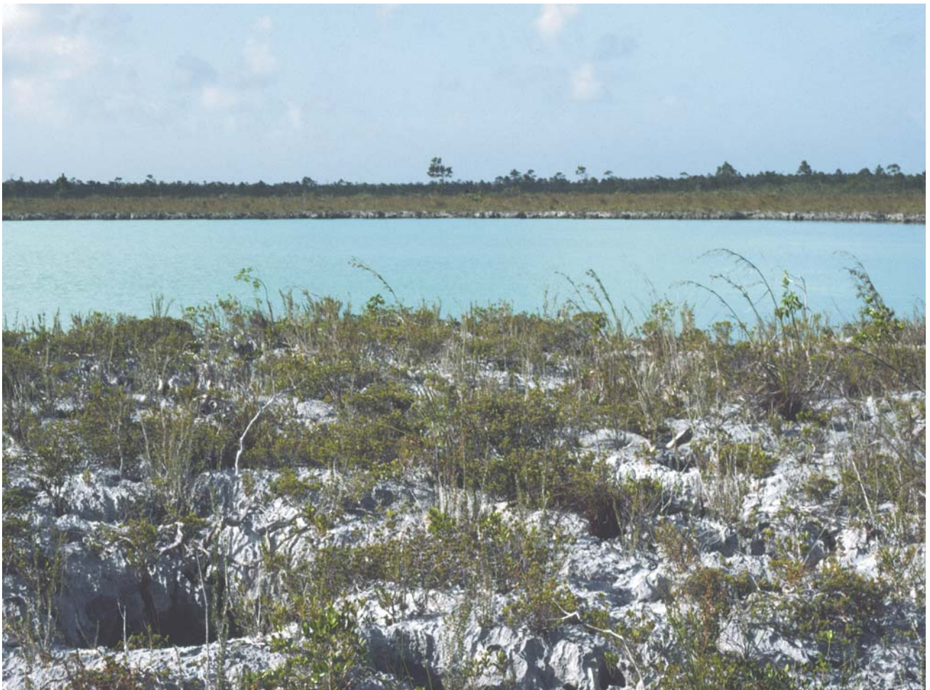
Figure 3. A cenote hole in the bare low-lying rockland landscape of the interior. The large size, circular shape and absence of cliffs are typical. The water appears “swimming-pool” blue.