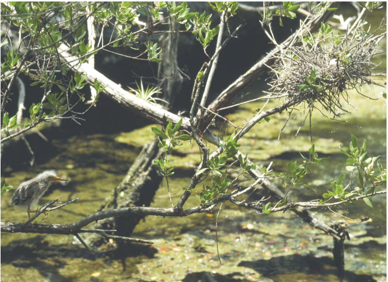
Figure 4. A juvenile heron and heron nest (top right) in branches overlying a blue hole. Note the mats of algae floating on the surface.