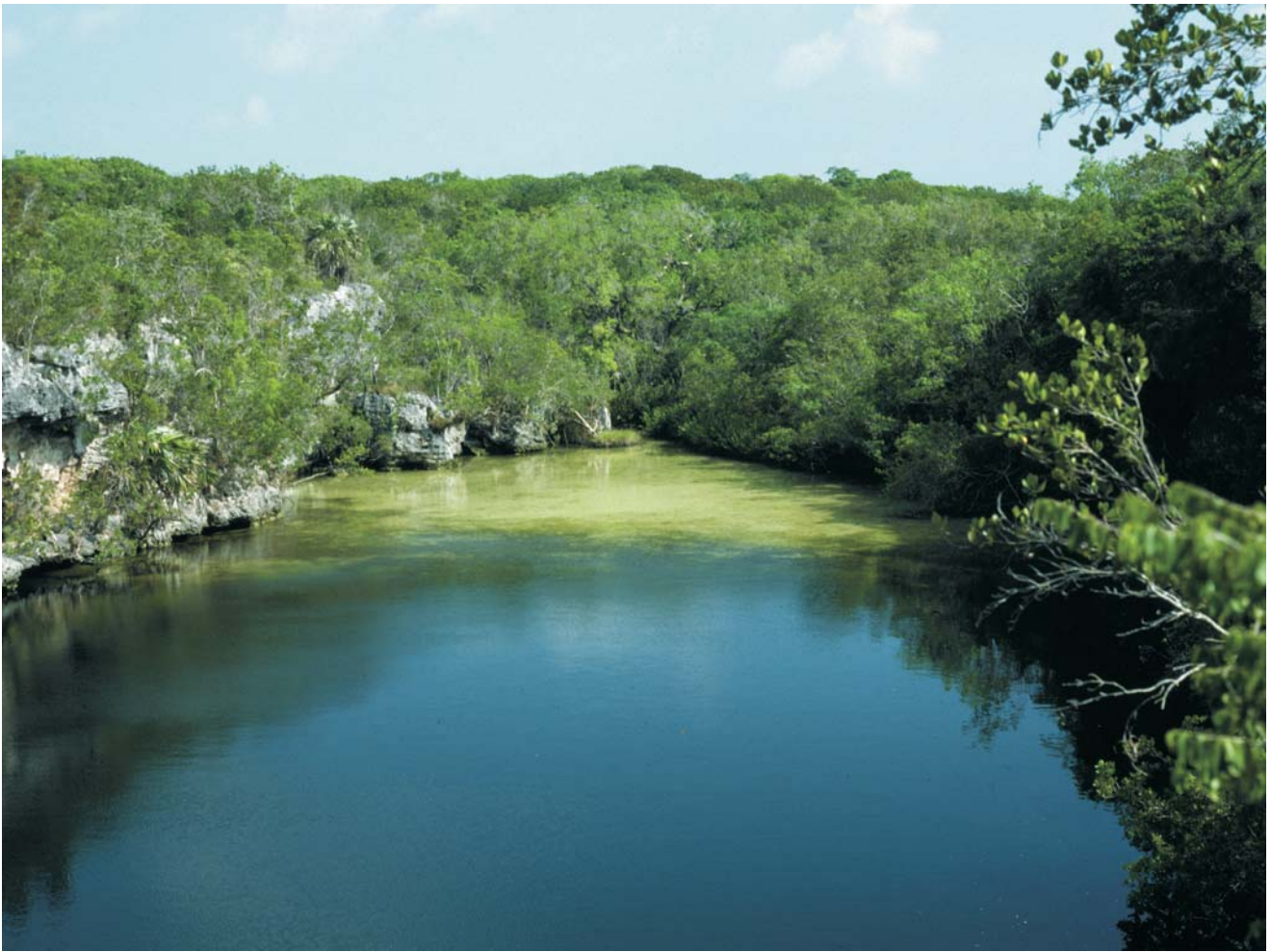
Figure 2. Rat Bat Lake. The dark water in the foreground is deep, whereas the shallows at the far end appear pale green.